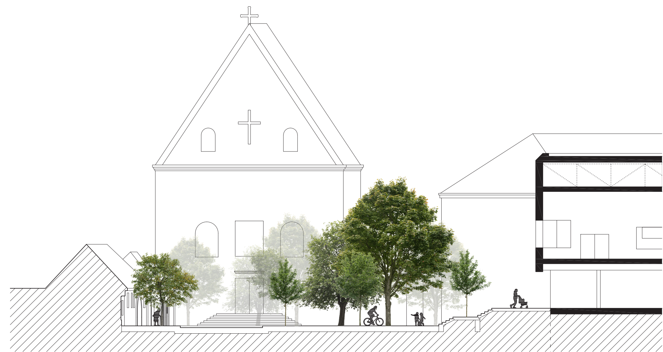
REZ C M 1:200