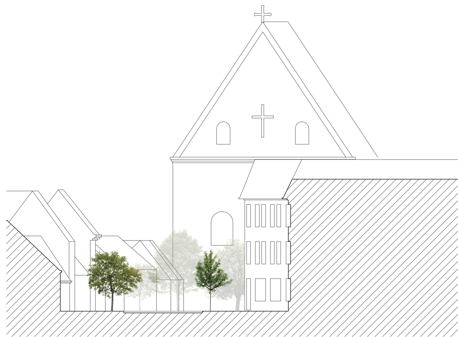
REZ D M 1:200