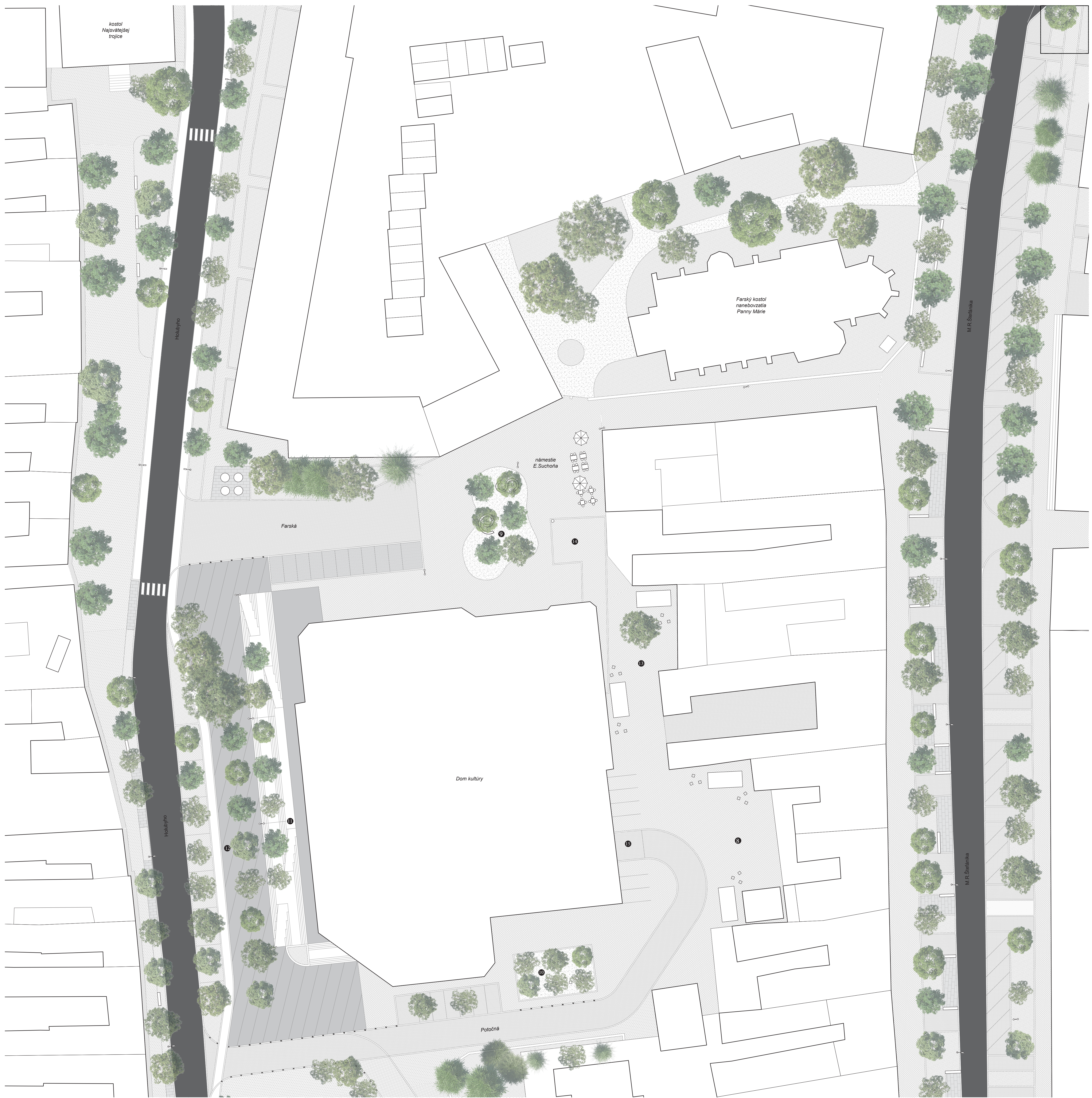
SITUÁCIA M 1:300